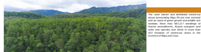
The once barren and desolated mined-out areas surrounding Biga Pit are now covered with an oasis of green growth and wildlife rich habitats. More than 687,117 seedlings of Acacia auriculiformis , Acacia mangium and other tree species now thrive in more than 412 hectares of mined-out areas in the environs of Biga and Loay.