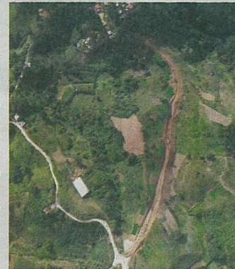
MAP OF NEW ROAD. Aerial view of Carmen Copper's ongoing road opening project from Sitio Danawan to Sitio Hag-it in Barangay Biga, Toledo City.