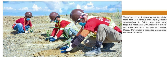
The photo on the left shows a portion of the more than 250 farmers from eight people's organizations in Toledo City who were tapped to rehabilitate 100 hectares of mined-out areas this 2020 as part of Carmen Copper Corporation's intensified progressive rehabilitation onsite.